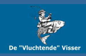
De "Vluchtende" Visser

Please note: Annual variations are common, no two years are equal.